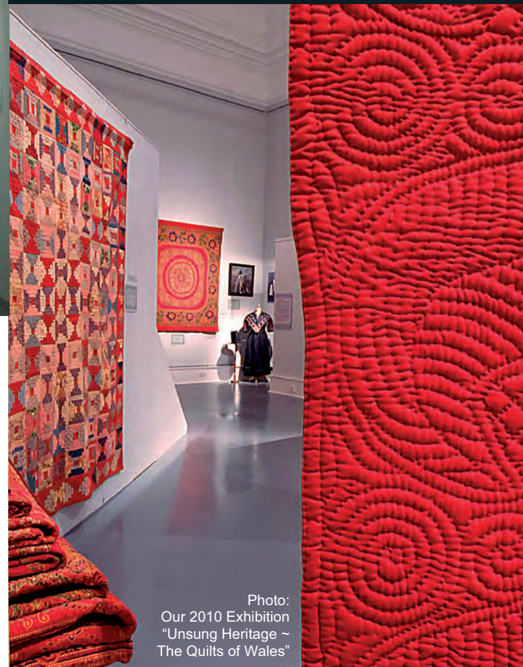
Photo: Our 2010 Exhibition "Unsung Heritage ~ The Quilts of Wales"

Photo: Our 2009 Exhibition "Quilts From The Heartland". The main exhibition in the Courtroom changes every year. Additional exhibitions change more frequently