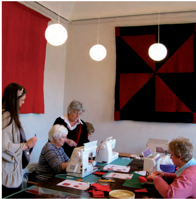
Back at the Town Hall, we offer a variety of textile-related courses for all levels of skill.