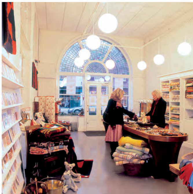
The Town Hall Gallery Shop contains an eclectic mix of new & old quilts, blankets, jewellery, cards, books, and many other goodies. Beside it, Town Hall Café-Deli serves delicious home-cooked daily specials